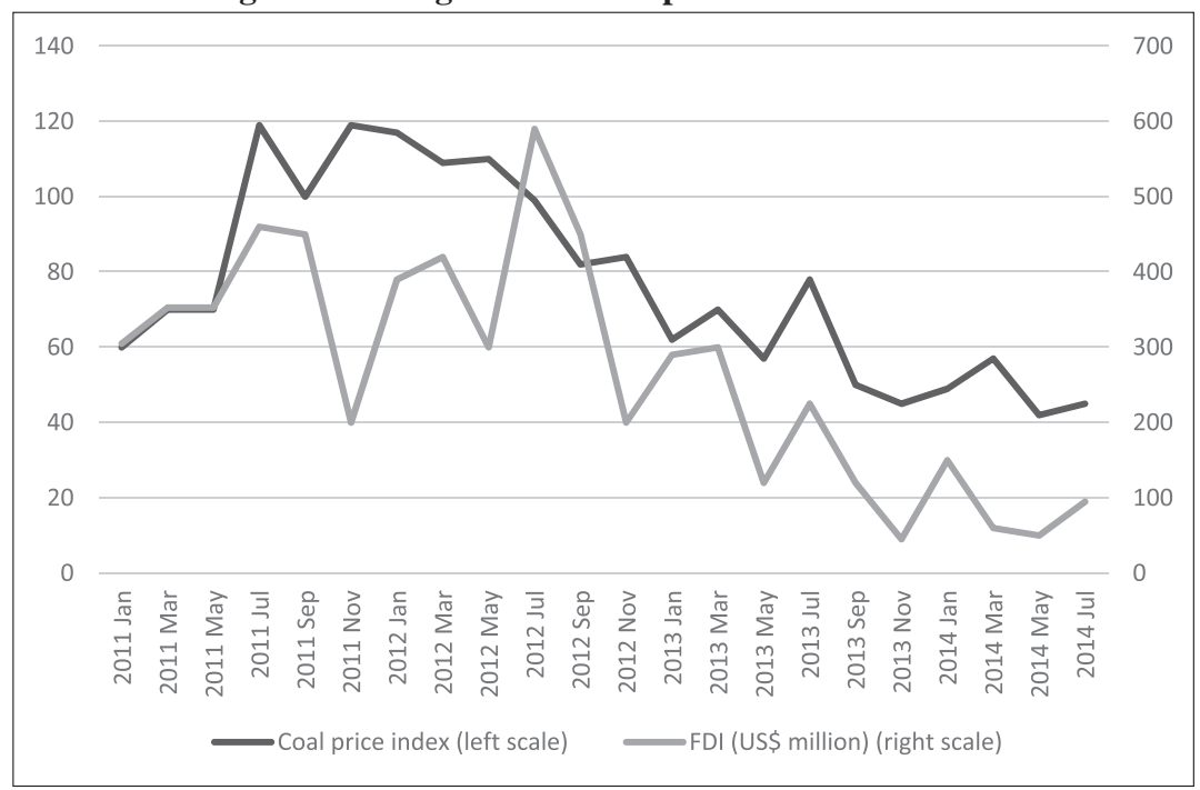
Figure 1: Mongolia's Coal Exports and Inward FDI

The Mongolian survey company "Sant Maral Foundation" publishes poll results annually<sup>6</sup>. The surveys not only reveal the rankings and ratings of political figures, but also include questions addressing socioeconomic issues. Respondents in Mongolia do not show a common consensus on big mining projects (Oyu Tolgoi, Tavan Tolgoi, etc.), state participation in mining, and public revenue management. The lack of an educated public creates favorable conditions for the rise of populist politicians.