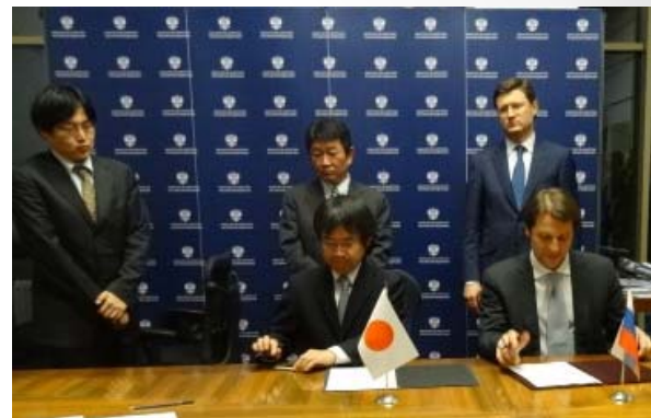
Signing ceremony for JASE-World-RDIF Collaboration Agreement, witnessed by Russian Energy Minister and Japanese Economic, Trade and Industry Minister (December 2013, Moscow)