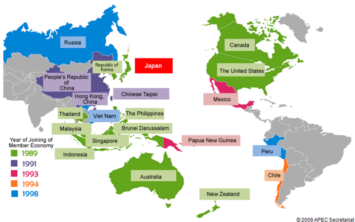
Figure 1: The Member Economies of APEC