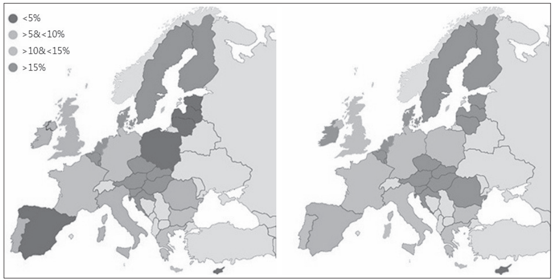
Figure 3: Map of Interconnection Levels in 2014 after Implementation of Current PCIs