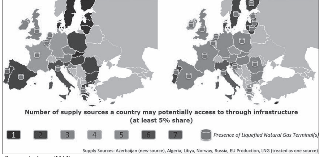
Figure 2: Gas Supply Sources in 2014 and 2022