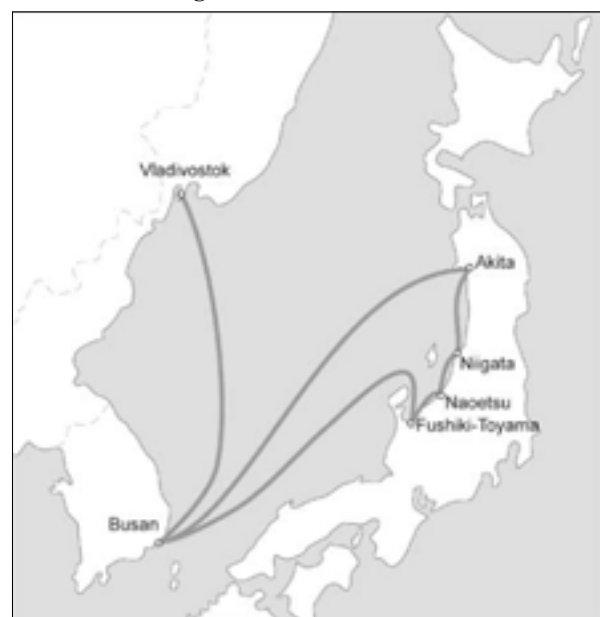
Figure 2.2-3 Sinokor Line

Identification of capacity is more difficult than in the cases that were reviewed above, because some services use segments of the transcontinental trunk lines or intra-Asian multi-destination lines, which use large-scale vessels. In addition, some shipping companies charter slots of the other companies' vessels. Due to these difficulties, a quantitative