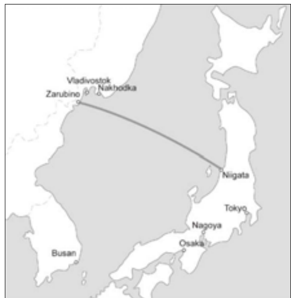
Figure 2.2-5 Niigata-Zarubino Line

The technical constraint of the loading/unloading operation is a significant problem even under the current minimum volume of freight. In fact, 40-foot containers as well as full-loaded 20-foot containers are not able to be handled at the port. A possible solution is to change the ship to a RO-RO ship, which doesn't need cranes. Despite the sincere efforts of related organizations, a suitable vessel has not been found so far. Another solution is to install one or more cranes at the berth, which requires more investment and time to realize. Once they are installed, however, the opportunity to develop shipping routes will be broadened.