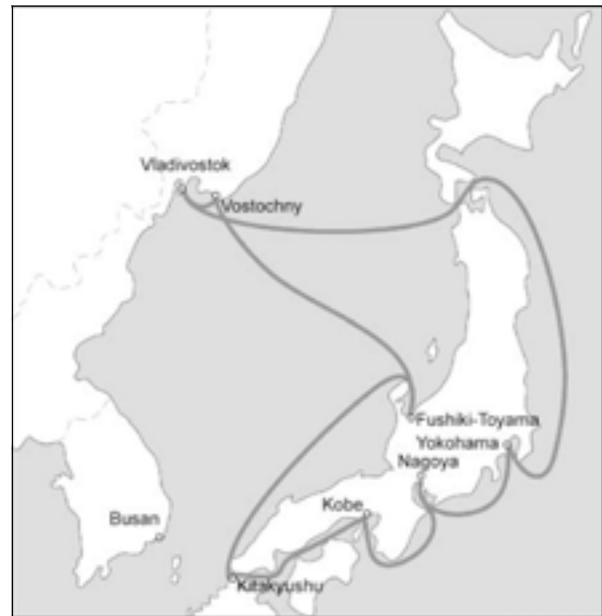
Figure 2.2-1 JTSL Direct Service

The former route operates a container vessel "VEGA DAVOS (698 TEU)" to call at the Japanese ports of Yokohama, Nagoya, Kobe, Kitakyushu (Moji), Toyama and the Russian ports of Vostochny and Vladivostok once every two weeks (Figure 2.2-1). The ultimate annual capacity of the shipping line can be calculated as a product of the vessel's capacity and number of voyages, while disregarding the factors of weather conditions, the need for technical maintenance, the dead capacity caused by the container inventory, and so on. Assuming that the vessel would perform 26 voyages per year, the capacity of this route is approximately 18,000 TEU one-way.