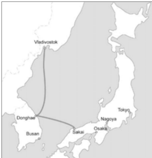
Figure 2.2-4 DBS Cruise Ferry

Tottori Prefecture supports this route, as it should promote the port and local economy of Sakaiminato City and Tottori Prefecture. The prefecture, together with local municipalities, provides subsidies to the shipping company. The maximum amount of subsidy is 1.5 million yen (approx. US$20,000) for each call at Sakai port.