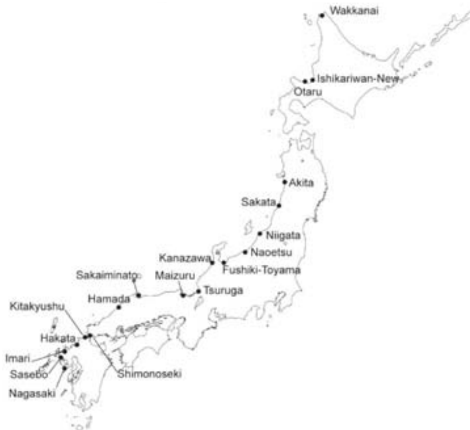
Figure 3.1-1 "Base Ports" of the Japanese West Coast