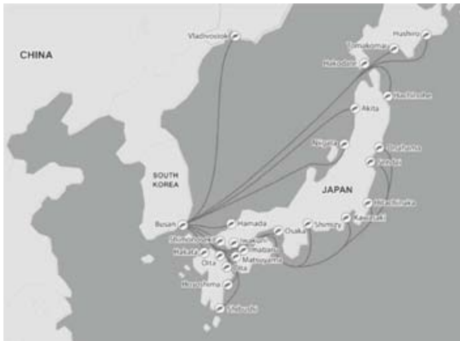
Figure 2.2-2 JTSL Transshipment Service

* The direct service ports also have transshipment services, although they are not shown on the map.