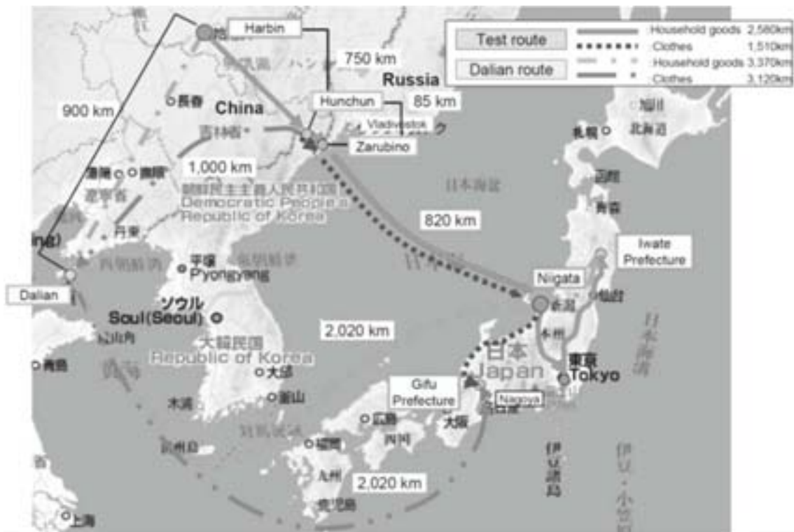
Figure 3.1-2 International Transport Experiment Integrated Map

The shipping route is operated by the DBS Cruise Ferry Company (ROK). With a ship called "Eastern Dream", the ferry handles approximately 480 passengers, or around 130 TEU if converted to container freight. The ferry