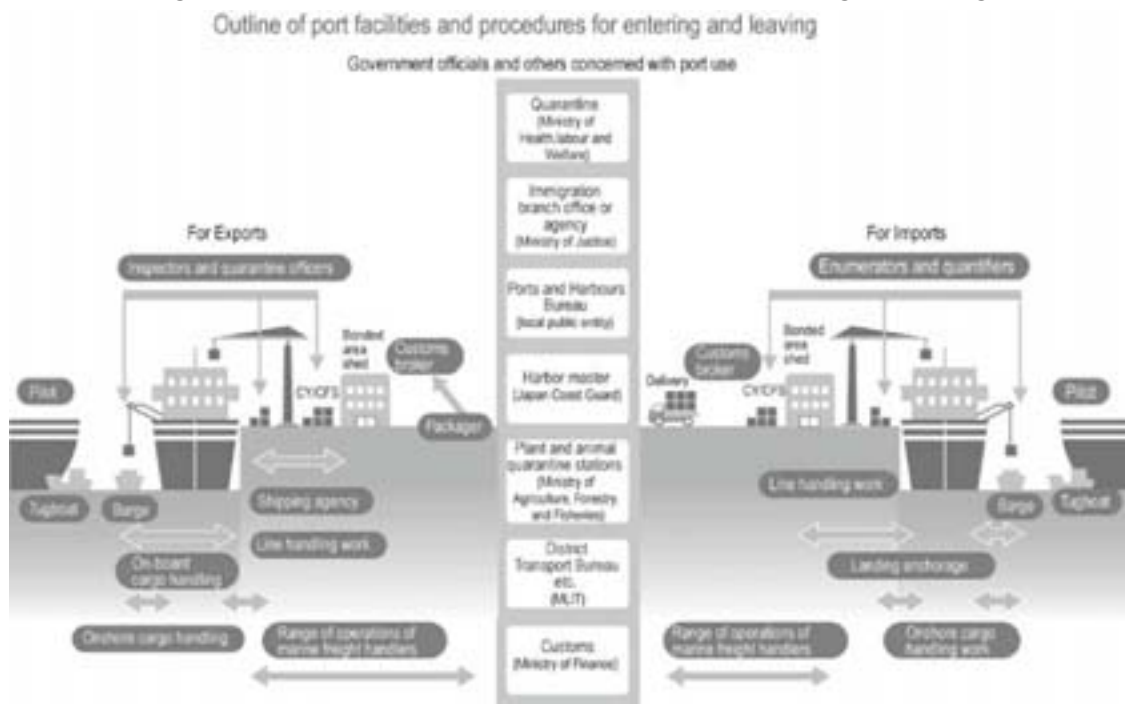
Figure 2.3-1 Outline of Port Facilities and Procedures for Entering and Leaving