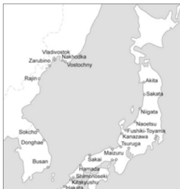
Figure 2.1-1: Container Handling Ports on Japan's West Coast

There are 13 ports located on the west coast of Honshu Island and the north of Kyushu Island at which container vessels call regularly (from Akita in the north to Hakata in south, Figure 2.1-1). Among them the ports of Hakata and Kitakyushu, which are in the north of Kyushu Island, are the largest, handling 541,000 TEU and 331,000 TEU in 2010, respectively. The largest on the west coast of Honshu Island is Niigata Port.